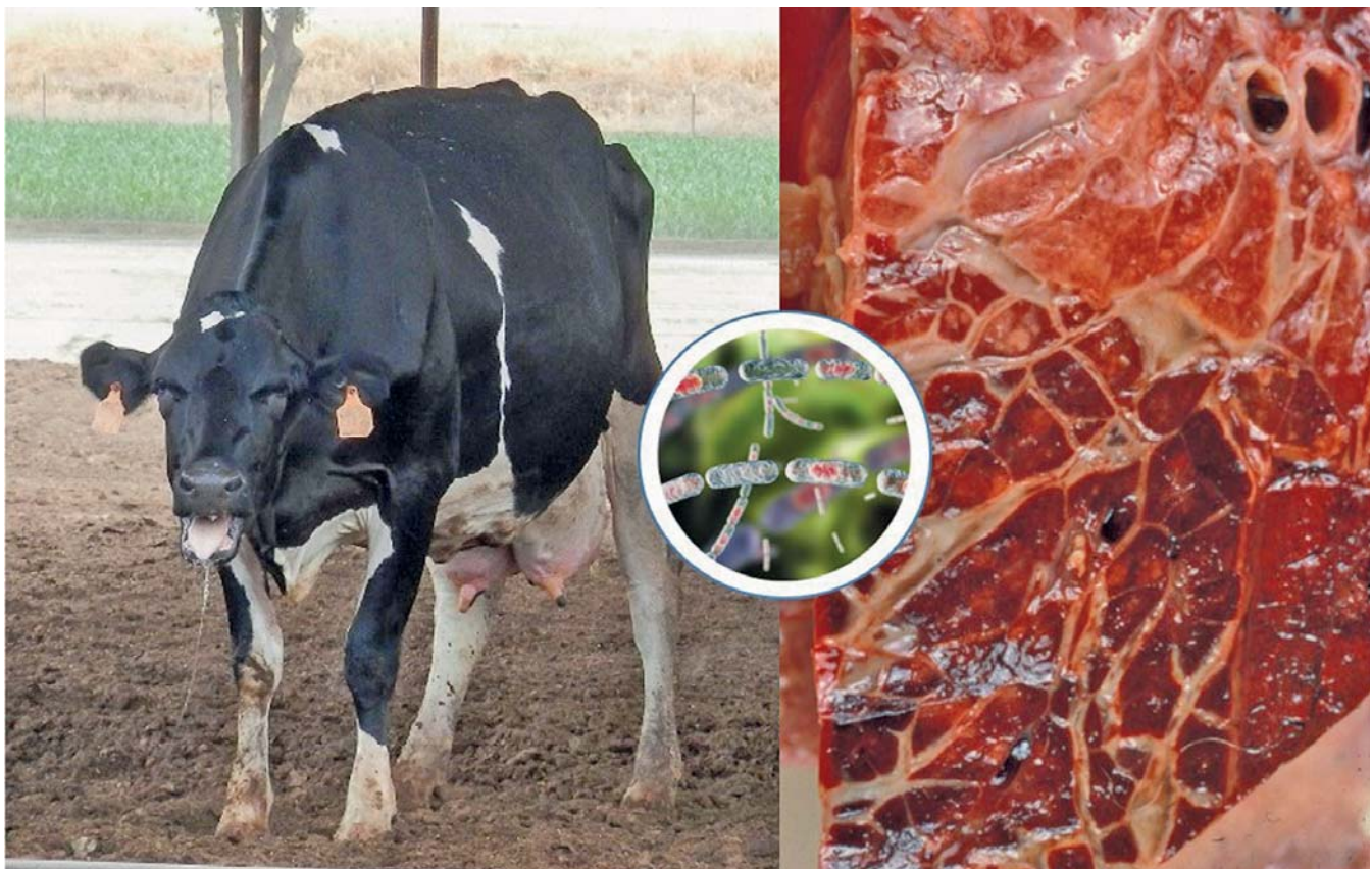
Figure 2 - Respiratory relapse in an adult cow.

quality colostrum (IgG < 50 mg/ml) 4 . To cope the problem, a useful tool could be the creation of a colostrum bank, collecting and freezing "good" quality colostrum aliquots. In this case, adoption of effective hygienic measures to avoid microbial contamination of stored colostrum must be considered pivotal. Animals affected by diarrhea showed a higher incidence of respiratory disease in later life periods. Impairment of enteric barrier triggers a microbial (mainly bacteria) translocation from gut to bloodstream and then to different organs, including lung (Fig. 1). Isolation of enteropathogenic bacteria, mainly Escherichia coli and Salmonella spp., from lung specimens of calves which experienced enteritis support this pathogenetic hypothesis. Furthermore, the anatomy of bovine lung (8 lobes, absence of interalveolar pores, presence of interlobular septa) hampers the microbial clearance, promoting persistence of silent foci of bacterial infection which can reactivate during the productive life causing the onset of relapsing respiratory episodes 5 (Fig. 2).