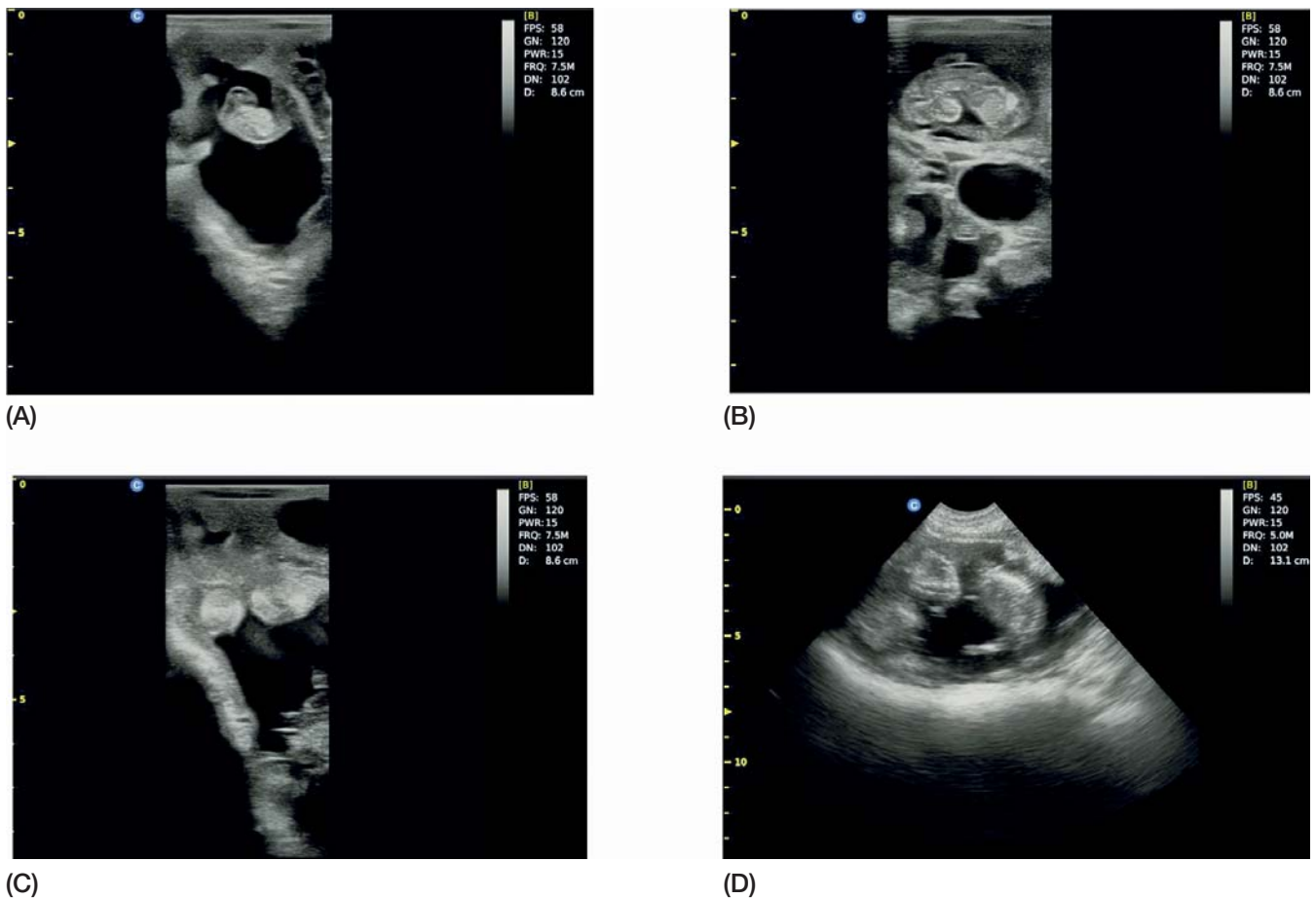
Figure 2 - Ultrasound images of Sarda sheep fetuses with different scores of foetal ossification and development of placental cotyledons according to pregnancy stage: (A), absence of both ossification and cotyledons on day 28 of pregnancy (D28); (B), a few ossifications and immature cotyledons on D37; (C): immature cotyledons on D42; (D), several ossifications and mature cotyledons on D47. Scale score of ossification: 1 = absence; 2 = a few, i.e. two or less; 3 = several ossifications, i.e. three or more ossifications; scale score of placental cotyledons: 1 = absence; 2 = visible but immature; 3 = mature, i.e. placental cotyledons which are more echogenic and brighter than immature ones and appear as 'C-shaped'.

3 = several ossifications, i.e. three or more ossifications); - and development of placental cotyledons as a measure of pregnancy stage using a visual scale score (1 = absence; 2 = visible but immature; 3 = mature, i.e. placental cotyledons which are more echogenic and brighter than immature ones and appear as 'C-shaped' 9,19 ).