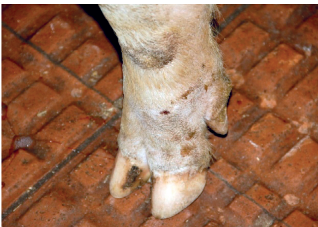
Figure 3 - Cracked wall (vertical) - Score 1.