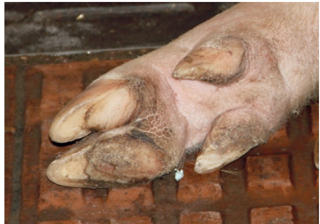
Figure 5 - Mono-digital heel overgrowth and erosion - Score 3.