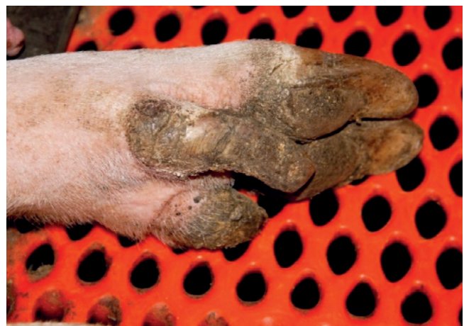
Figure 6 - Unilateral dew claw fracture - Score 3.