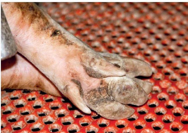
Figure 4 - Heel overgrowth and erosion - Score 1.

less clear. Studies did not find any effect 29 , whereas other studies described a negative relationship between feet disease and farrowing performance 16 .