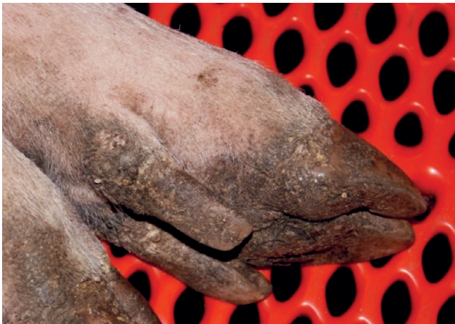
Figure 2 - Dew claws overgrowth - Score 2.