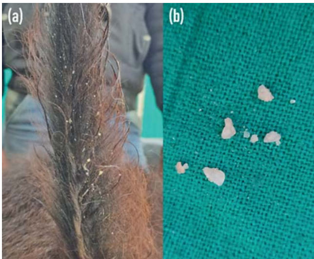
Figure 3 - (a) Multiple uroliths were found towards the base of the tail after relieving the obstruction. (b) Macroscopic struvite uroliths expelled through the urine.

phosphorus 3 . The shortage of drinking water could further act as a precipitating factor in the development of urolithiasis. Sharma et al. (2005) conducted study on twelve bovine calves suffering from urolithiasis. The haemato-biochemical parameters showed increased values of Hb, PCV, TLC, neutrophils, BUN, creatinine, inorganic phosphorus and potassium. According to the study, these parameters returned towards normal levels after surgical intervention and fluid therapy 12 . Ruminants are the most susceptible group of animals that are affected by obstructive urolithiasis and is extensively reported in male sheep, goat and cattle 4 . Rupture of the bladder occur as a sequela to the complete obstruction of urethra due to lodgment of calculi 13 . Early signs of urethral obstruction include severe pain that leads to stranguria 14 . Sandy calculi which initially get lodged in the urethra may later lead result in complete urethral obstruction in young animals 15 . The treatment is based on history, clinical signs and the type of calculi with surgical correction being the supreme and ultimate choice.