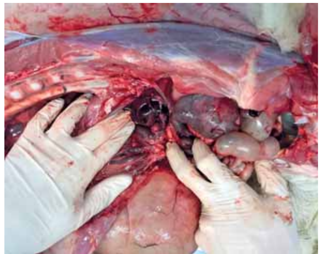
Figure 3 - Necropsy findings in the abdominal cavity of the six-months old cria. The topography of the gastrointestinal tract was conserved, except for a small intestinal loop, 5 cm long, which resulted entrapped within the epiploic foramen. The wall of the herniated organ was hemorrhagic and necrotic. In the picture, forestomach were moved ventrally to allow visualization of the herniation area.

rhagic fluid accumulation was found in the thoracic cavity and post mortem congestion stasis was present in the right lung. Heart was normal in dimension and morphology.