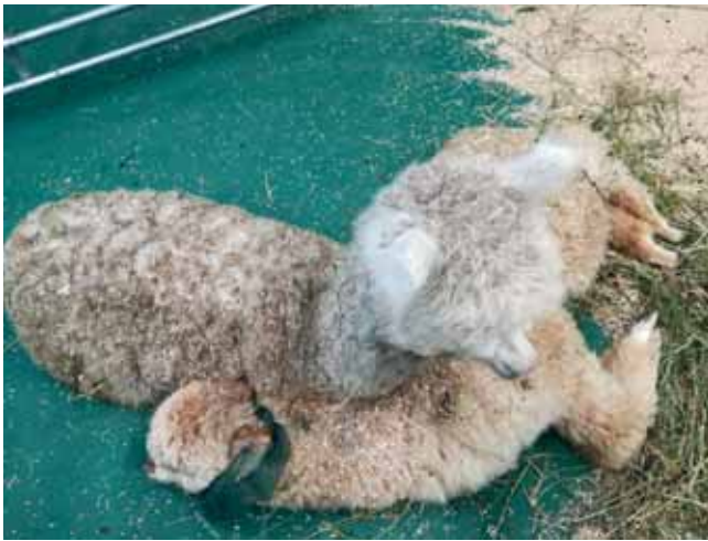
Figure 1 - Two crias of the same age, approximately six months, at presentation at the OVUD. The male sick cria (on the right) was under-grown compared to the healthy female of the same age. Pain-related behavior, such as frequent recumbence and stand-up together with depression and anorexia, were shown.

dence the most common surgical lesions 2 . An exploratory laparotomy or laparoscopy should be considered an extension of the physical examination. The outcome of gastrointestinal surgery is often reliant upon early diagnosis and timely surgical intervention.