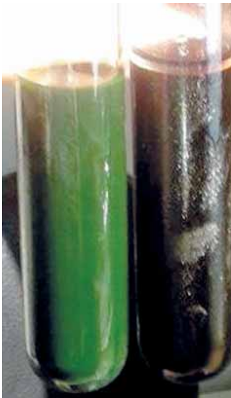
Photo 2 Left, positive reaction (green); right, negative reaction (brown).

Distilled water was used as blank control to correct any errors related to the analysis procedure. The blank test was carried out in parallel with each set of analysis.