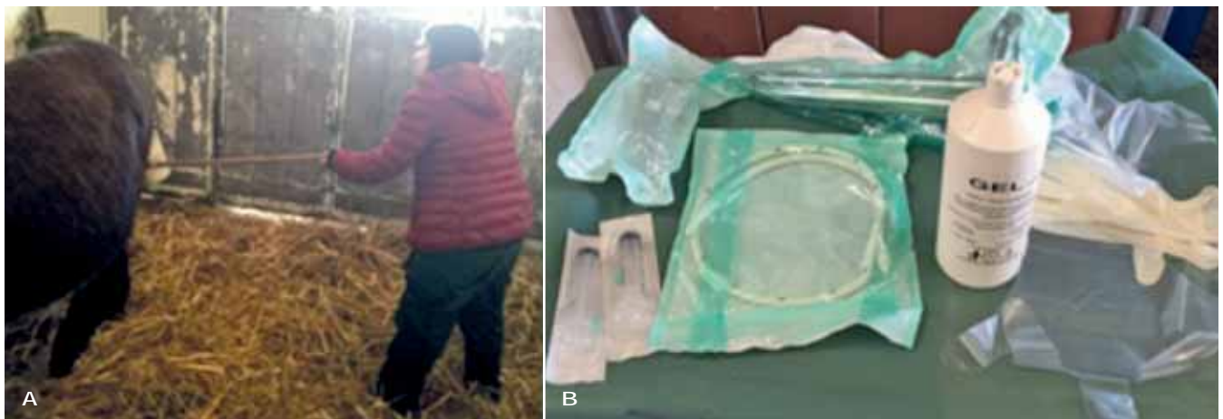
Photo 1 - A) non-invasive urine collection; B) kit for bladder catheterization.

The reactions were carried out exclusively under a chemical hood. Operators involved in the procedure were adequately equipped with Personal Protective Equipment (PPE).